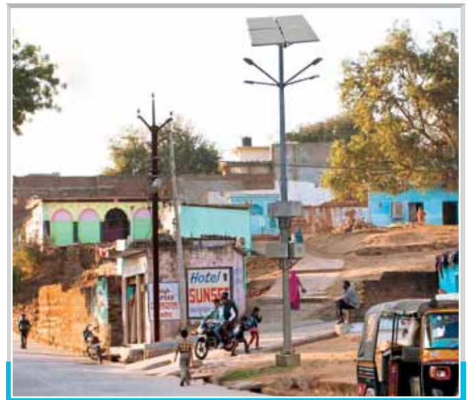
Havells Solar Mini Mast