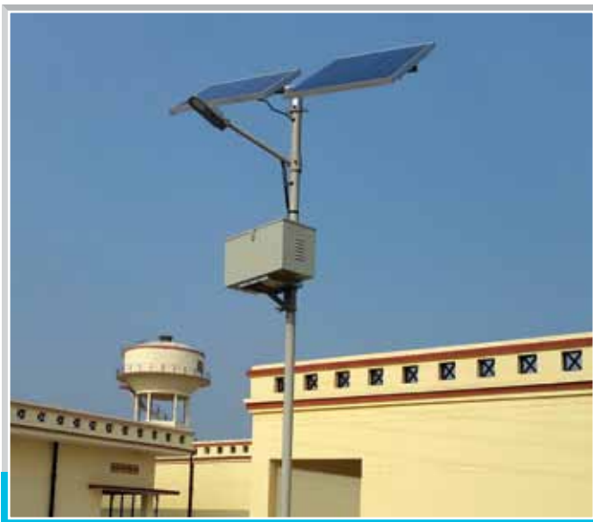
Havells Solar Street Light

Highly efficient poly crystalline solar modules are used which are tested for longer durability & manufactured with innovative technologies. These modules are designed to withstand highly corrosive atmosphere and heavy wind loads. The modules are certified for industry standards IEC61215, IEC61730 (safety class 1 & 11).